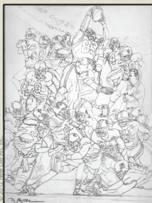
1. & 2.